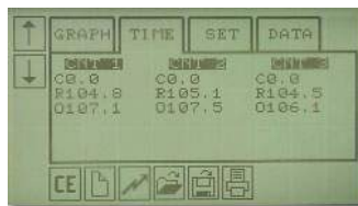
Numerical results display