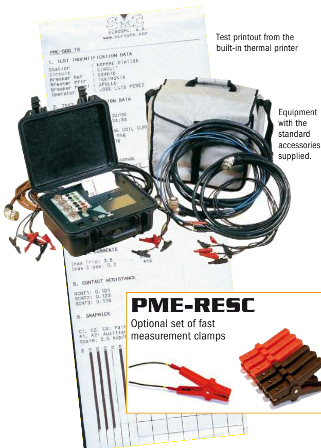
Test printout from the built-in thermal printer